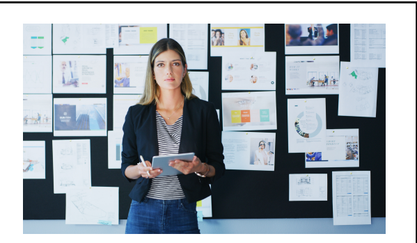
Hustler Hacks: Scaling Without Breaking

The best CEOs don't work harder— they think smarter . The top 5% do what others won't: (1) Decide things faster. (2) Protect their energy. (3) Invest in strategy. <u>Small shifts = massive impact.</u> Which 5% move will you make this month?